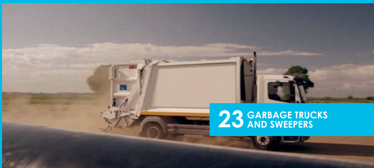
23 GARBAGE TRUCKS AND SWEEPERS