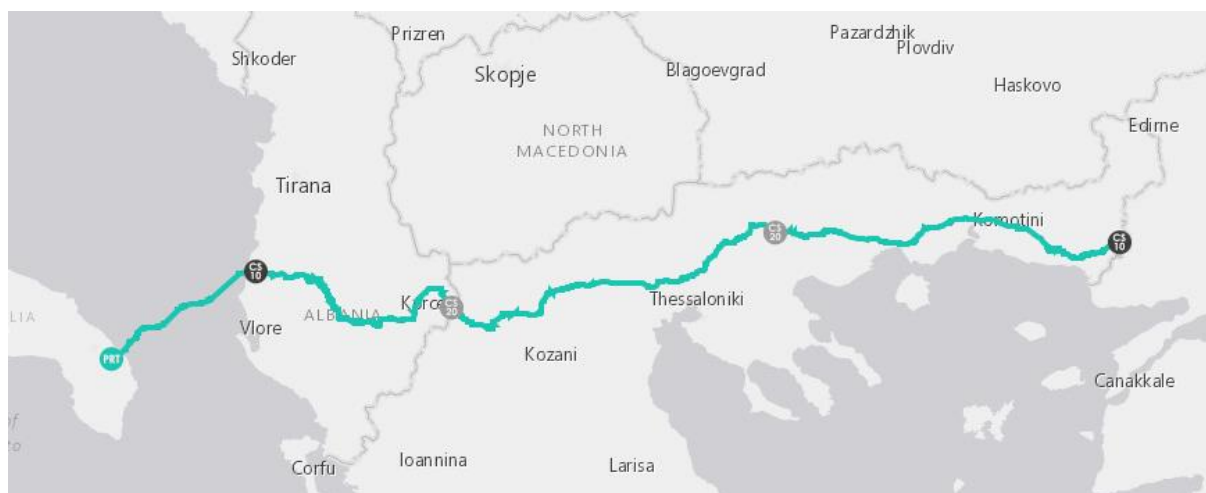
Figure 1 – TAP Pipeline Route

Starting at the border of Greece and Turkey, where it connects with the Trans Anatolian Pipeline (TANAP), TAP crosses Northern Greece, Albania and the Adriatic Sea to southern Italy, where connects to the Italian gas transportation grid. The TAP project represents the final stage in the development of the Southern Gas Corridor, traversing 6 countries and 3,500 km.